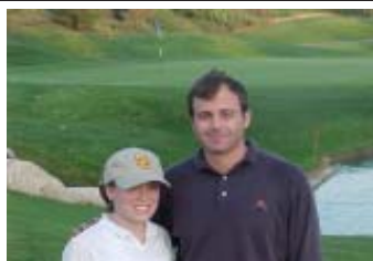
Closest to the Pin winners