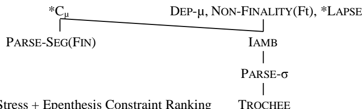
Figure 2. Stress + Epenthesis Constraint Ranking

While an iambic analysis of Chukchansi simply captures the position of epenthesis in the above situations, a trochaic analysis of Chukchansi stress cannot easily do so. Trochaic stress does not favor [(li.'him).ta?] over *[('lih).(mi.ta)?] (or the *CLASH-avoiding parses *[('lih).mi.ta?] or *[lih.(mi.ta)?]), as both candidates contain well-formed bimoraic trochees. Picking the former candidate would require another, likely ad-hoc, constraint, such as the alignment constraints used in Zoll (1993). Under the iambic analysis, the selection of [(li.'him).ta?] (and the other cluster-repairing outputs shown above) is a TETU effect: when the grammar can freely choose between an iambic or a trochaic (i.e., poorly iambic) structure, it chooses the iambic one. The complete ranking of constraints so far is shown in the Hasse diagram below (Figure 2):